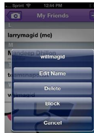
You can block a user from sending you snaps.