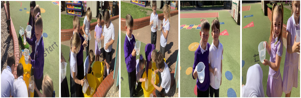
Year 3 Lizards had a great time learning different ways to strike a ball in our NUFC session!